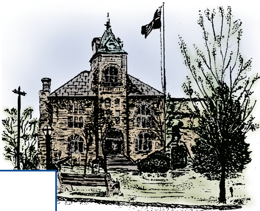
Drawing Courtesy of Joyce Love

POSTMASTER: Send change of address notices to MONROE LEGAL REPORTER, 913 Main Street, Stroudsburg, PA 18360